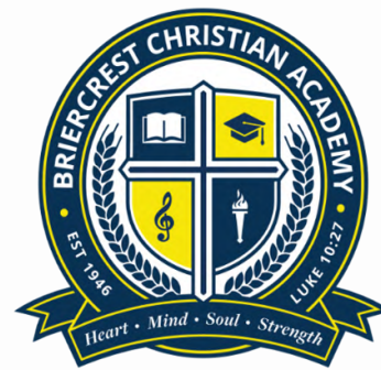
Briercrest Christian Academy